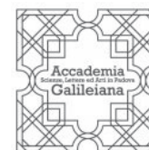
The Galilean Academy, Padua